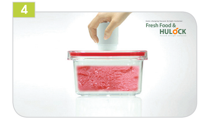
Pump it for 3\sim5 times to make the container airtight.