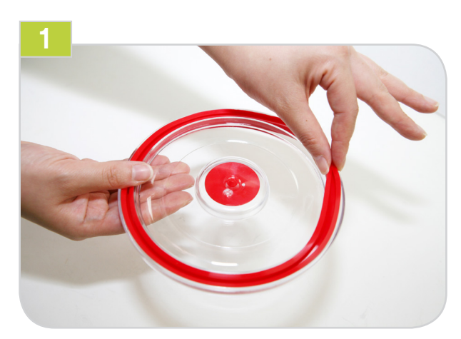
Grab silicone nozzle and pull it out from the indentation. You can easily remove it from the lid.