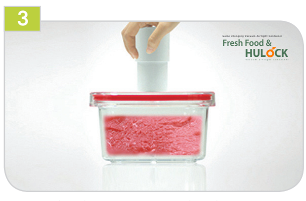
Place the vacuum pump on the indentation in the middle of the lid.