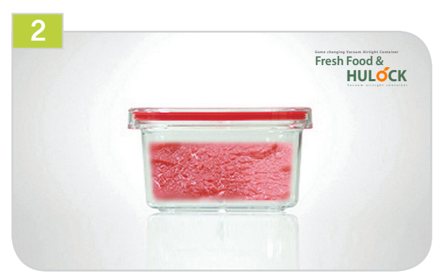
Press the lid and close it.