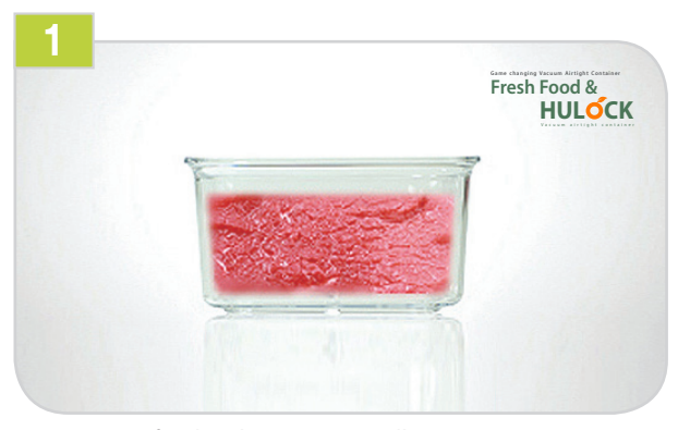
Put food in the container. Fill up to 85% capacity.

Hulock is an airtight conditioner system that uses different methods from all other airtight containers. Below directions will help you to make the inside of the container a vacuum.